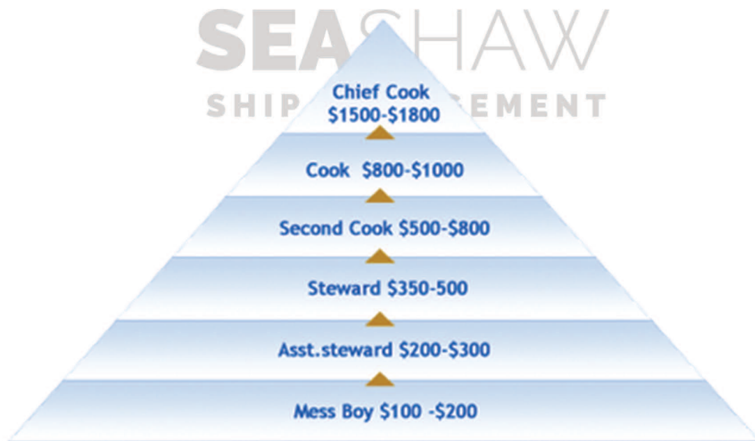
SALOON RATING CAREER PATH